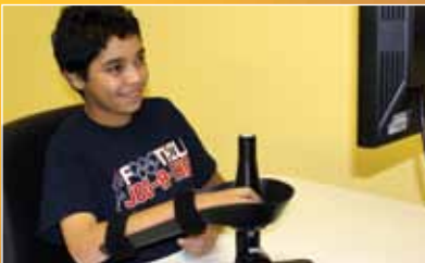
Advanced Technology Robotics