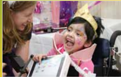
Children's Dream Fund