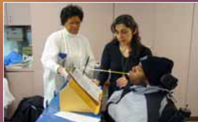
Rancho Therapy Programs

THE RANCHO LOS AMIGOS FOUNDATION PROUDLY PRESENTS