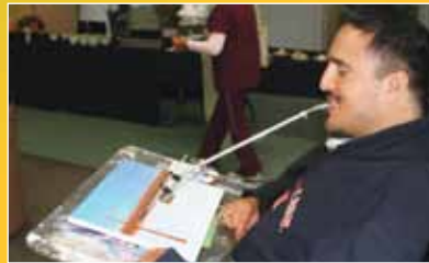
The Art of Rancho Program