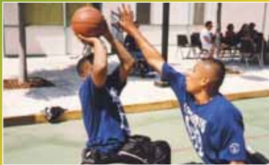
Wheelchair Sports Program