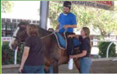
Therapeutic Horseback Riding