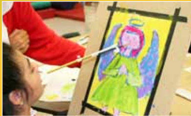
Don Knabe Pediatric Arts Program