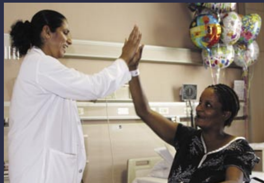
Rancho's nurses are recognized for their excellence and leadership, fostering an environment of outstanding care for patients.

Rancho's Medical Home initiative brings care to the next level for patients. Each has an ongoing relationship with a personal physician and their "RanchoCare" team that manages the patient's health care, whether the care is provided at Rancho, at another provider, or at home. In this way, Rancho Los Amigos takes care of all the patient's health needs, becoming a true health care home.